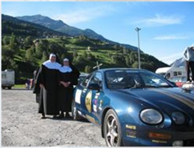
Nuns on the run” - Apparently it’s a long story